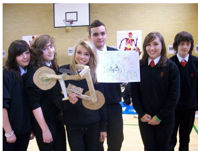
The prototype of the battery charger that connects to a bicycle.